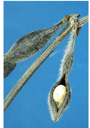
Figure 1. Soybean seed beginning to swell from moisture available through pod wall.

Performance may vary from location to location and from year to year, as local growing, soil and weather conditions may vary. Growers should evaluate data from multiple locations and years whenever possible and should consider the impacts of these conditions on the grower's fields. 181008101644 100818SEK