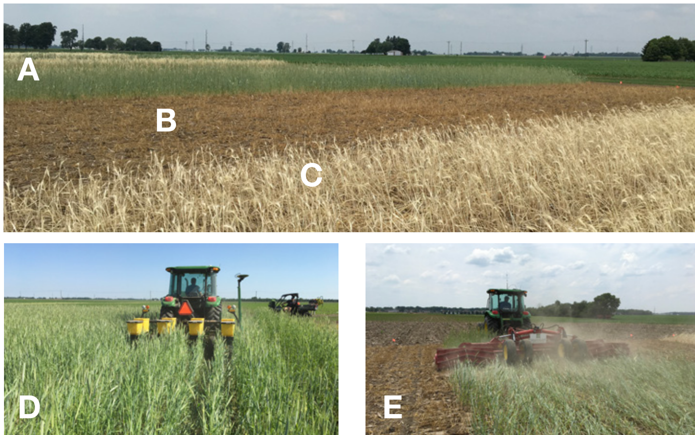
Figure 2. Cereal rye cover crop treatments: rye ready to be crimped (A), herbicide application 14 days prior to planting (B), herbicide application at planting (C), soybean planted into rye prior to crimping (D), crimping of cereal rye following soybean planting (E).