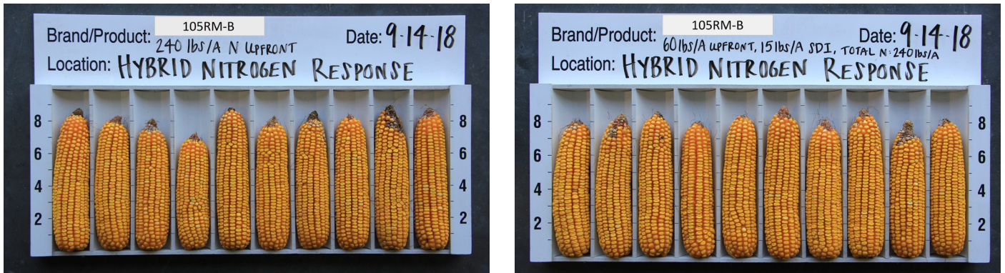
Figure 2. Representative cobs from the all-upfront treatment (left) and the fertigation treatment (right) for the 105RM-B product.