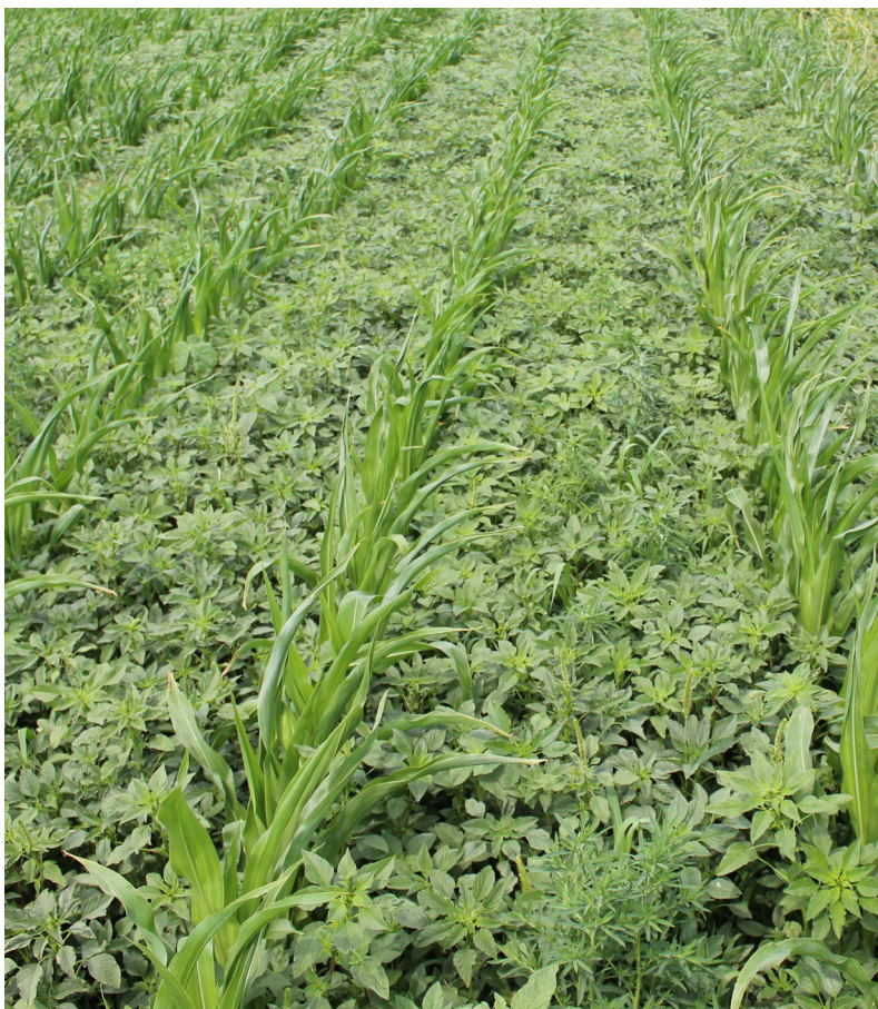
Figure 1. Non-treated plot containing Palmer amaranth and kochia.